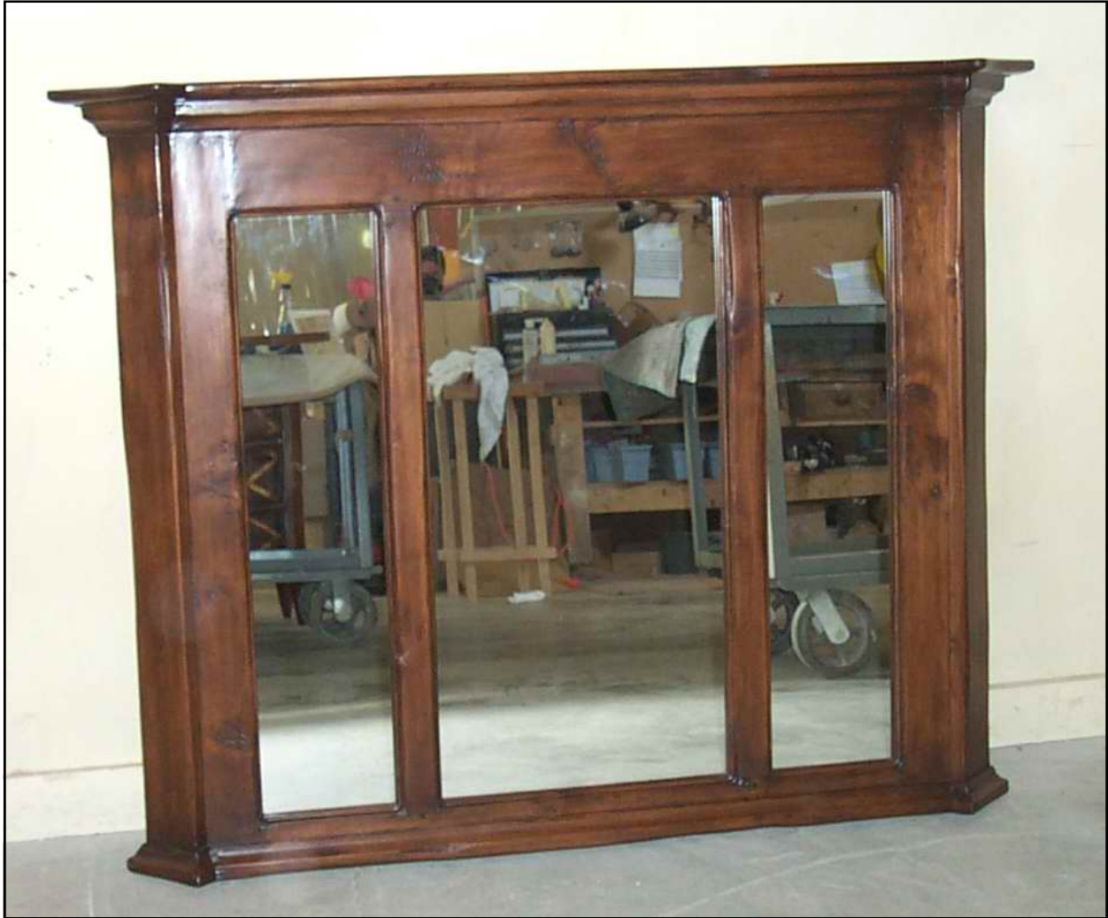
STYLE # 2804 CASCADE MIRROR

P.O. BOX 3089 • TWIN FALLS, IDAHO 83303-3089 • 208-736-8700 • FAX 208-736-8900