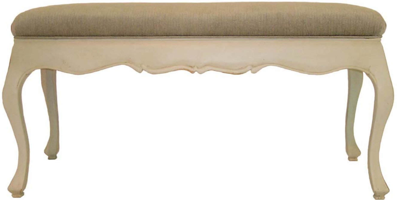
STYLE # 2710-UP ELISE UPHOLSTERED BENCH

P.O. BOX 3089 • TWIN FALLS, IDAHO 83303-3089 • 208-736-8700 • FAX 208-736-8900