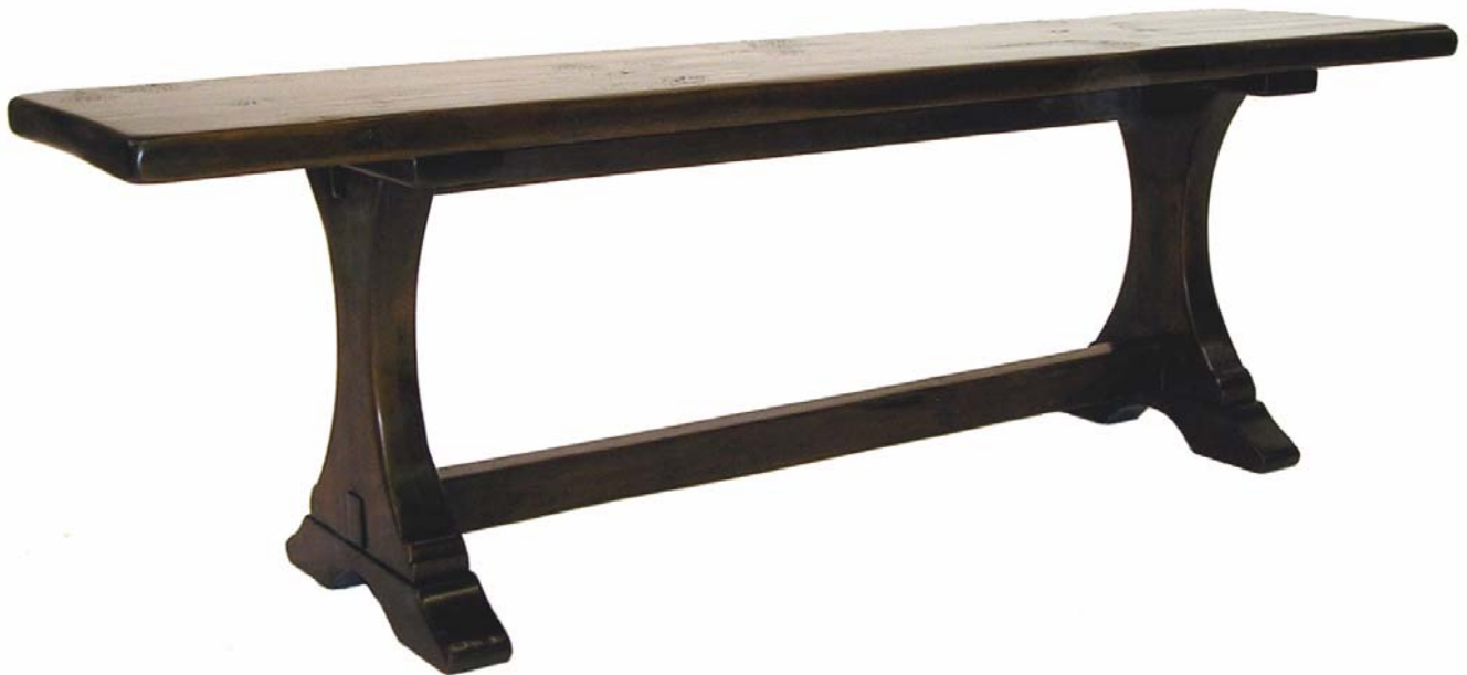
STYLE # 2705 JOSEPH BENCH

P.O. BOX 3089 • TWIN FALLS, IDAHO 83303-3089 • 208-736-8700 • FAX 208-736-8900