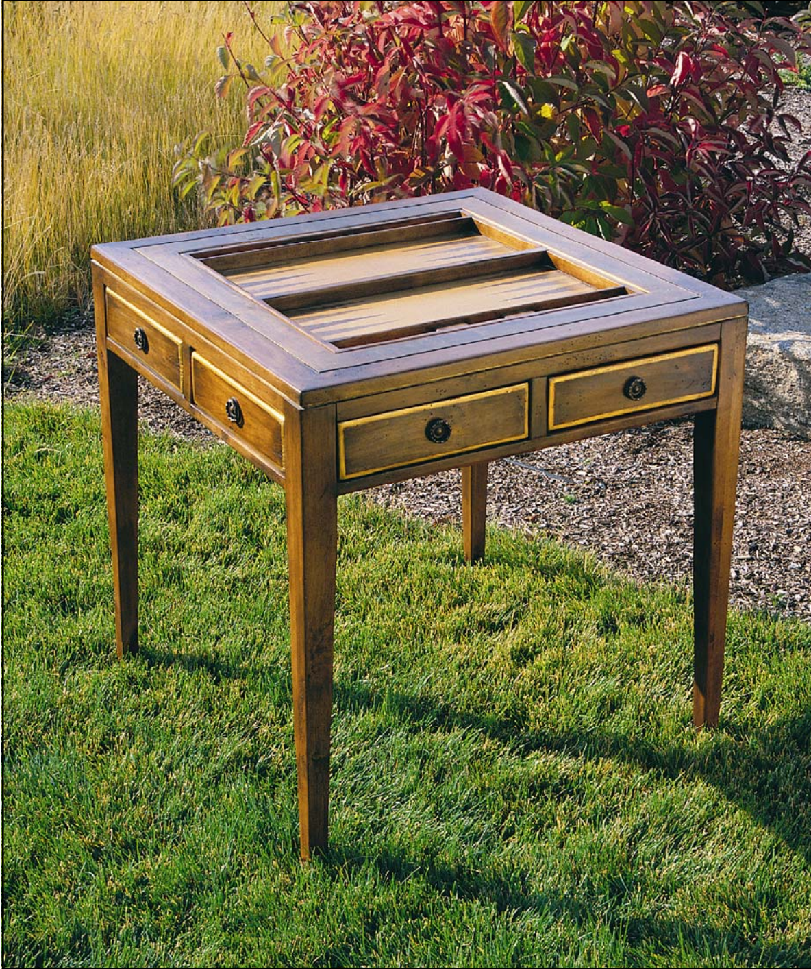
STYLE # 2310 BERKLEY BACKGAMMON TABLE

P.O. BOX 3089 • TWIN FALLS, IDAHO 83303-3089 • 208-736-8700 • FAX 208-736-8900 www.farmhousecollection.com ALL DESIGNS COPYRIGHT • ALL RIGHTS RESERVED