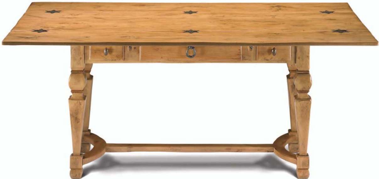
STYLE # 2111 CARRARA FLIP-TOP CONSOLE TABLE

P.O. BOX 3089 • TWIN FALLS, IDAHO 83303-3089 • 208-736-8700 • FAX 208-736-8900