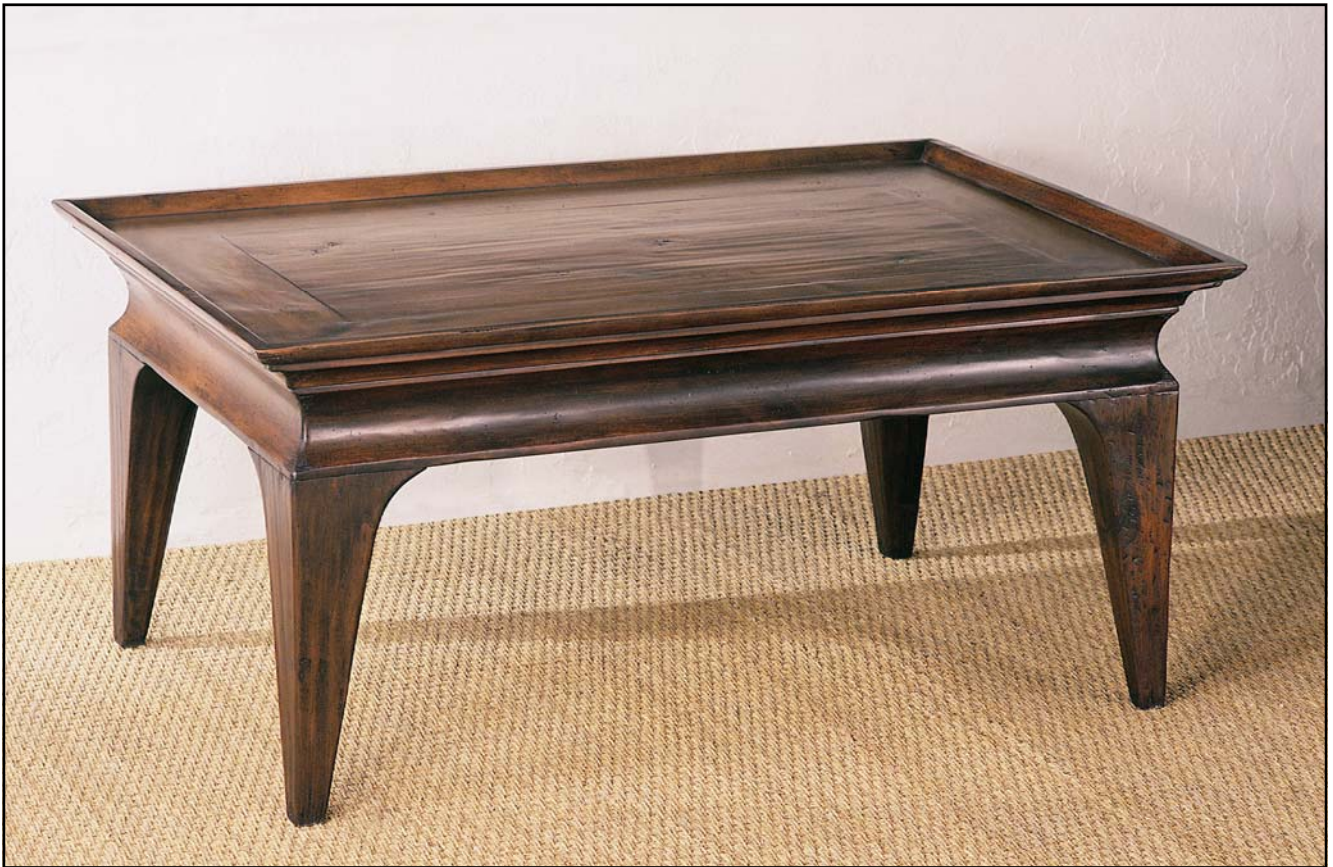
STYLE # 2015 MERIDIAN COFFEE TABLE

P.O. BOX 3089 • TWIN FALLS, IDAHO 83303-3089 • 208-736-8700 • FAX 208-736-8900