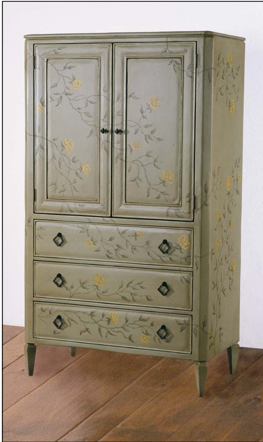
STYLE # 1930 GENESEE A/V CABINET

P.O. BOX 3089 • TWIN FALLS, IDAHO 83303-3089 • 208-736-8700 • FAX 208-736-8900