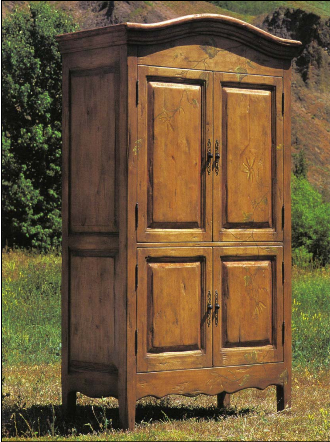
STYLE # 1801 MAURICE POCKET DOOR ARMOIRE

P.O. BOX 3089 • TWIN FALLS, IDAHO 83303-3089 • 208-736-8700 • FAX 208-736-8900 www.farmhousecollection.com ALL DESIGNS COPYRIGHT • ALL RIGHTS RESERVED