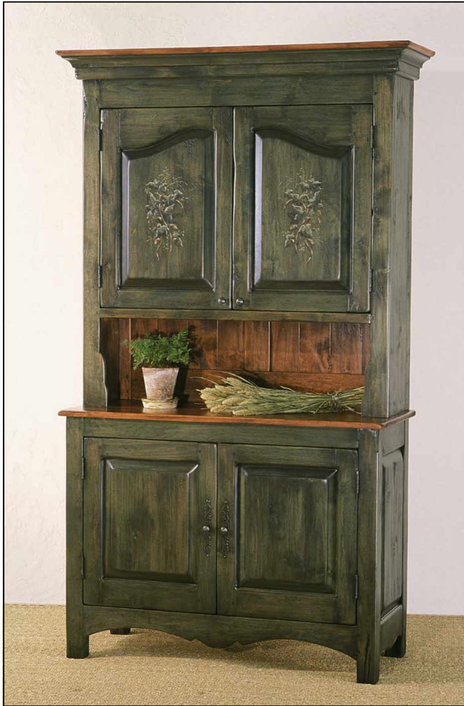
STYLE # 1701 HUTCH TOP II (shown with farmhouse sideboard I style #1610)

P.O. BOX 3089 • TWIN FALLS, IDAHO 83303-3089 • 208-736-8700 • FAX 208-736-8900 www.farmhousecollection.com ALL DESIGNS COPYRIGHT • ALL RIGHTS RESERVED