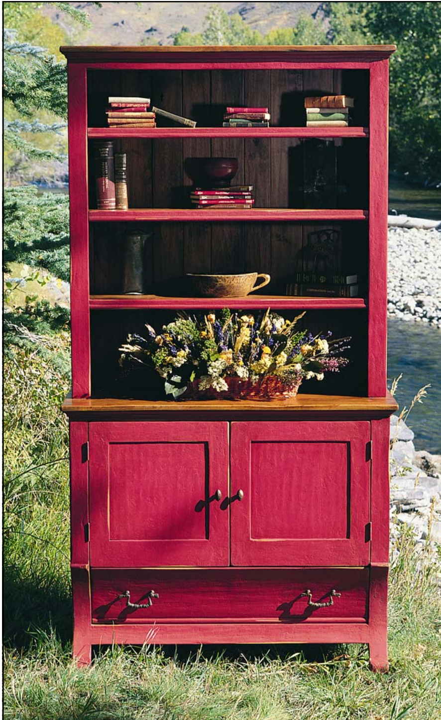
STYLE # 1612 ALTURAS SIDEBORD (shown with alturas hutch top style #1704)

P.O. BOX 3089 • TWIN FALLS, IDAHO 83303-3089 • 208-736-8700 • FAX 208-736-8900 www.farmhousecollection.com ALL DESIGNS COPYRIGHT • ALL RIGHTS RESERVED