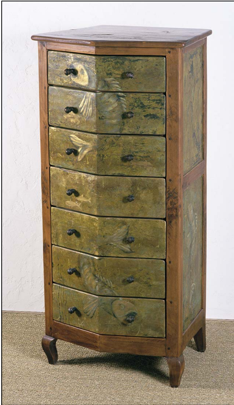
STYLE # 1529 PENTAGON SEVEN DRWR CHEST

P.O. BOX 3089 • TWIN FALLS, IDAHO 83303-3089 • 208-736-8700 • FAX 208-736-8900 www.farmhousecollection.com ALL DESIGNS COPYRIGHT • ALL RIGHTS RESERVED