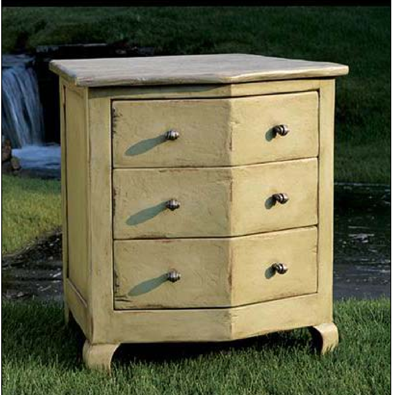
STYLE # 1525 PENTAGON THREE DRAWER CHEST

P.O. BOX 3089 • TWIN FALLS, IDAHO 83303-3089 • 208-736-8700 • FAX 208-736-8900 www.farmhousecollection.com ALL DESIGNS COPYRIGHT • ALL RIGHTS RESERVED