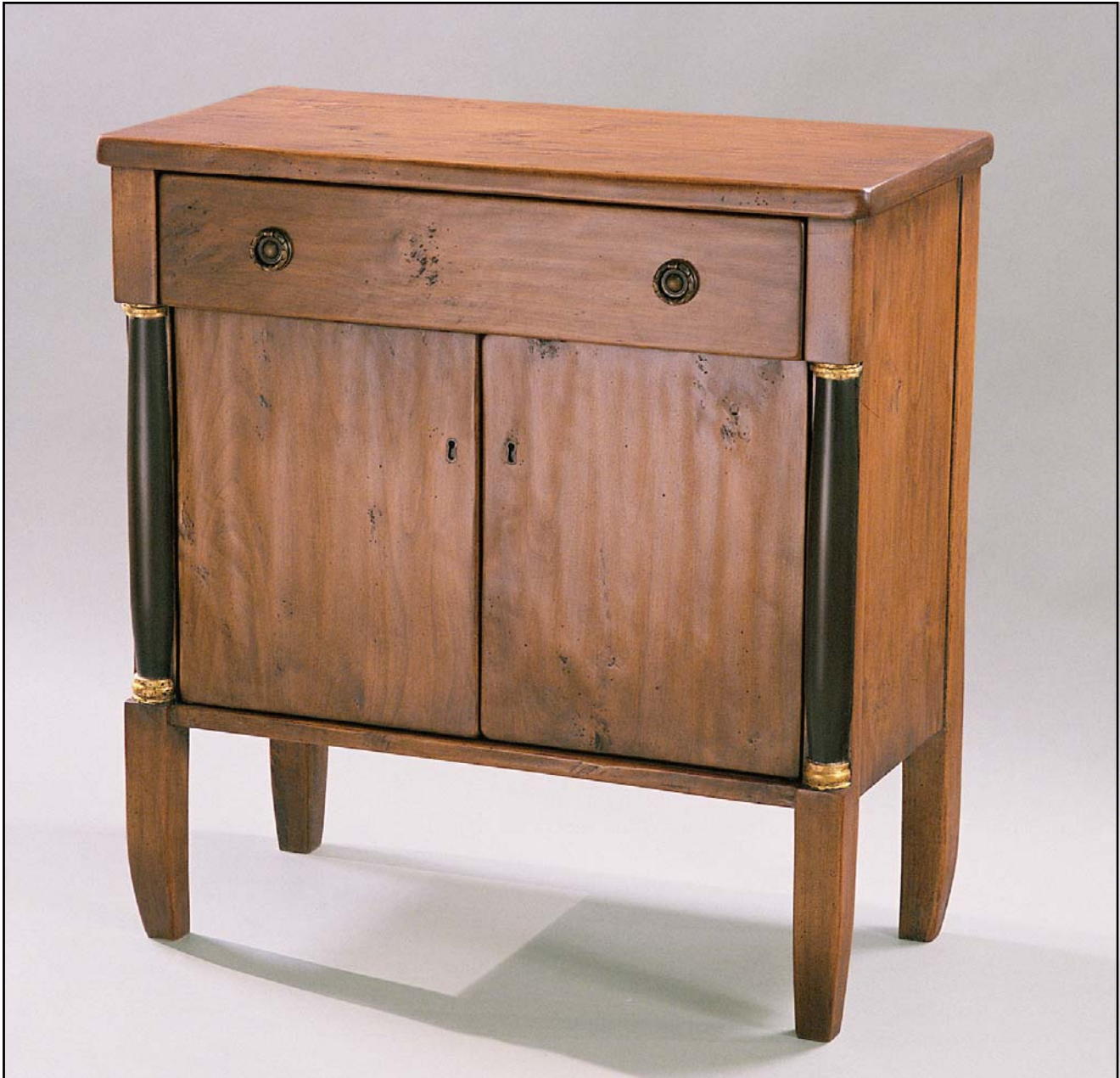
STYLE # 1409 WHITEBRIDGE II CABINET

P.O. BOX 3089 • TWIN FALLS, IDAHO 83303-3089 • 208-736-8700 • FAX 208-736-8900 www.farmhousecollection.com ALL DESIGNS COPYRIGHT • ALL RIGHTS RESERVED