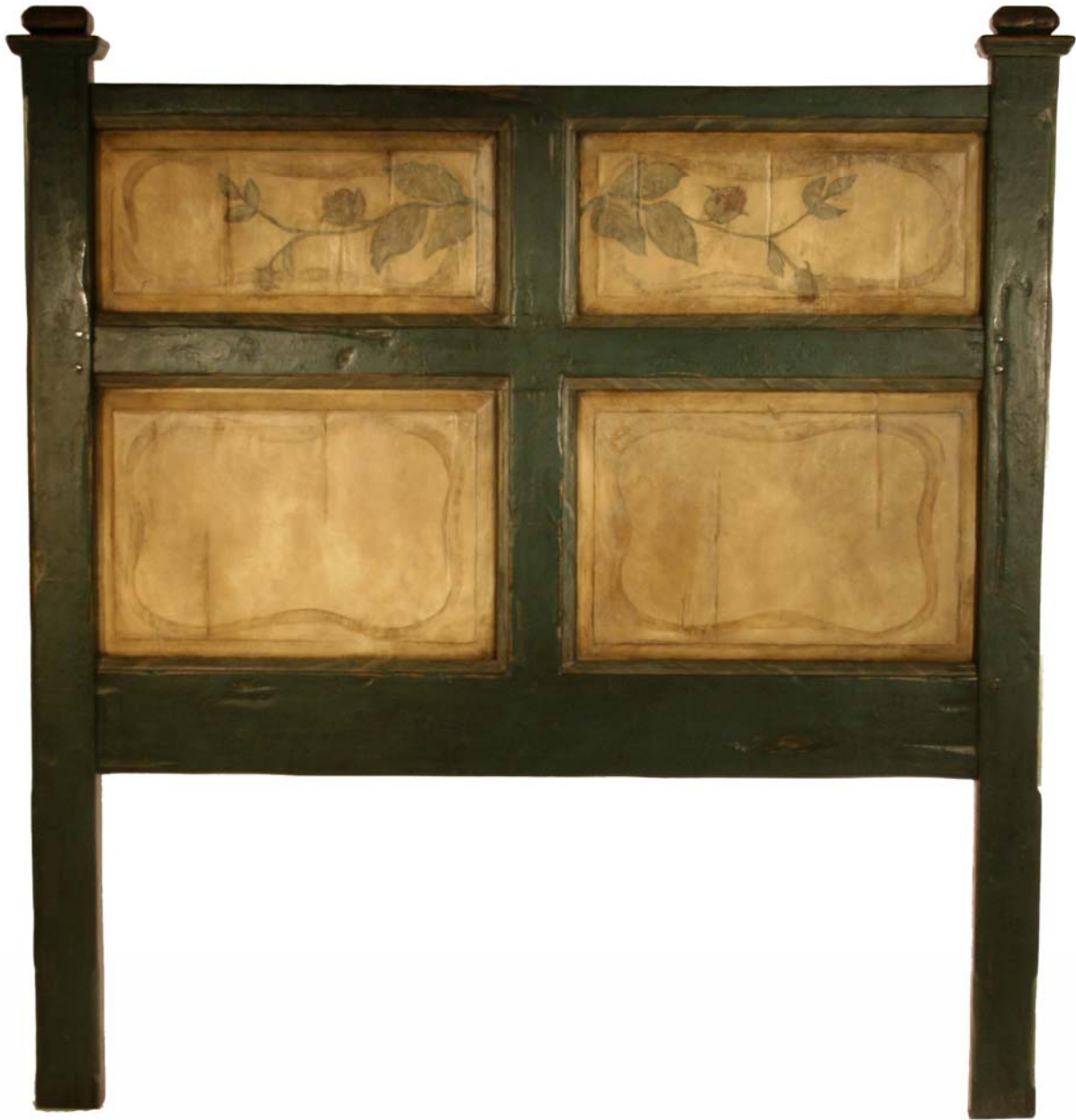
STYLE # 1032 ALEXANDER HEADBOARD

P.O. BOX 3089 • TWIN FALLS, IDAHO 83303-3089 • 208-736-8700 • FAX 208-736-8900